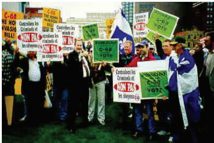
Conservative Member of Parliament Peter Goldring with Canadians protesting Bill C 68, the wasteful shotgun registry bill on Parliament Hill

$2 billion could provide 100,000 units of affordable rental housing when federal funds are partnered with provincial funds. Canada's entire homeless emergency shelter population is 15,000. The Conservatives would cut the wasteful long gun registry and invest in Canadians' true priorities.